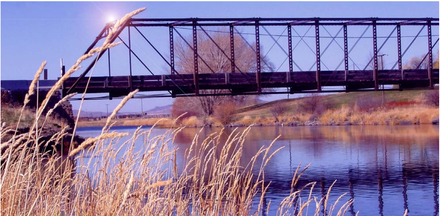
Fun Farm Bridge at Chester